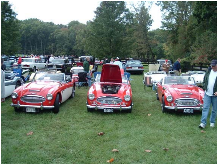
Hunt Country Classic Photos