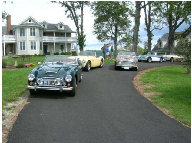
All our Healeys at the Huffnagel Estate