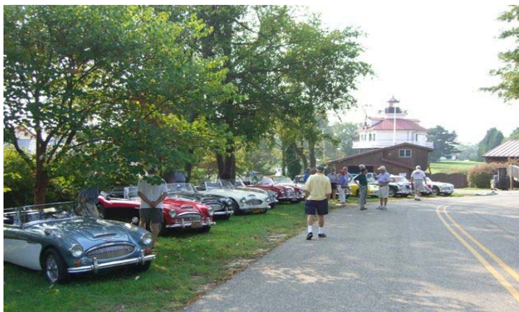
Car Show on Saturday morning Outside the Calvert Marine Museum