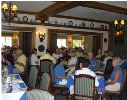
Lunch at the Bavarian Inn