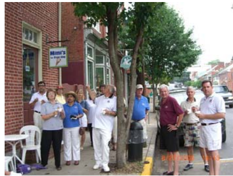
Cars at The Inn