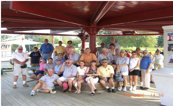
A happy group after our boat trip.