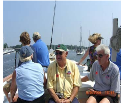
The WM TENNEYSON—for the cruise down the river. What a view we all had!