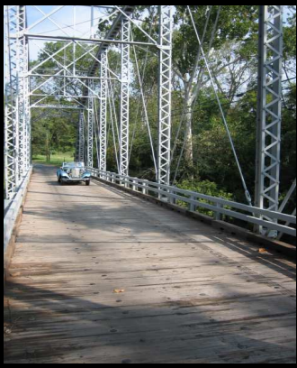
Charlie and Eileen Baldwin arriving from the west!

driving instructions from now-rallyemaster Herman, and off we went on a three-hour 60 mile tour of the countryside. We left Gettysburg heading south and wound up coming back into town from the northwest!