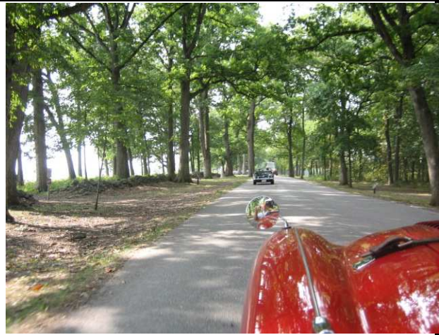
Healeys in procession along Seminary Ridge.