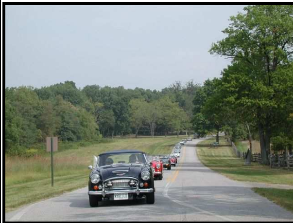
Along Seminary Ridge.

We proceeded across the beautiful countryside along Seminary Ridge, stopping at sev-