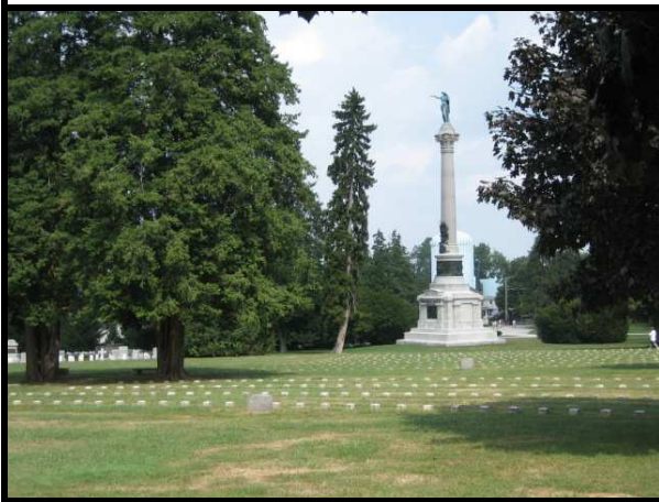
Soldier's National Monument at the cemetery