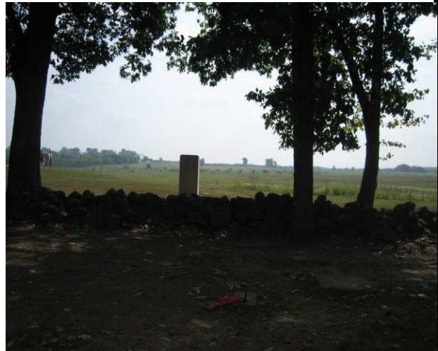
Site of Pickett's Charge: A view toward the Union Army's position on distant Cemetery Ridge.